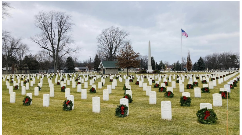
Above: Cemetery at The Ohio Veterans Home in Sandusky